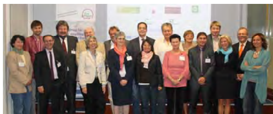
Ecopaperloop Kick-off meeting in Milano